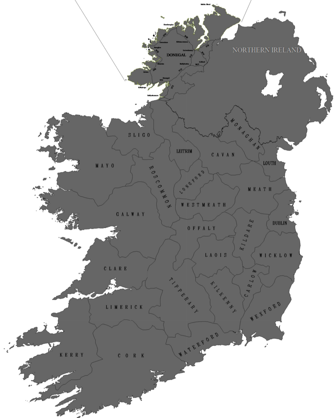
Site Location - Ireland / Donegal Context